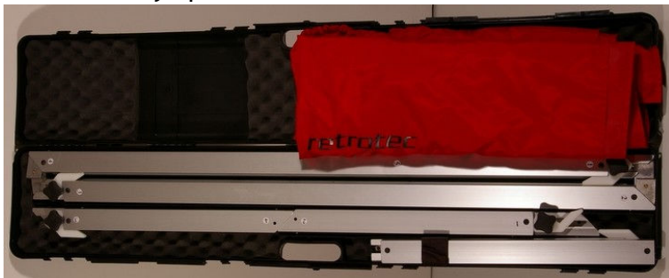
Rapid Set-Up Door Panel with Case

Retrotec Model Q4E consists of a DM-2, a 3200 Fan and a rapid set-up hard door panel. Add fan case, software and accessory options.