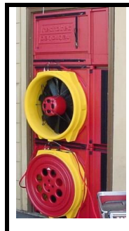
2 fans secure in hard panel