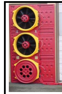
3 fan hard panel