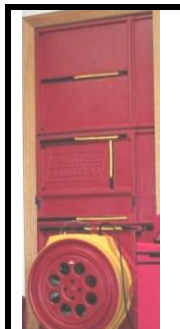
rapid set-up hard panel