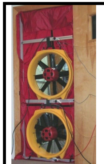
2nd fan for large buildings